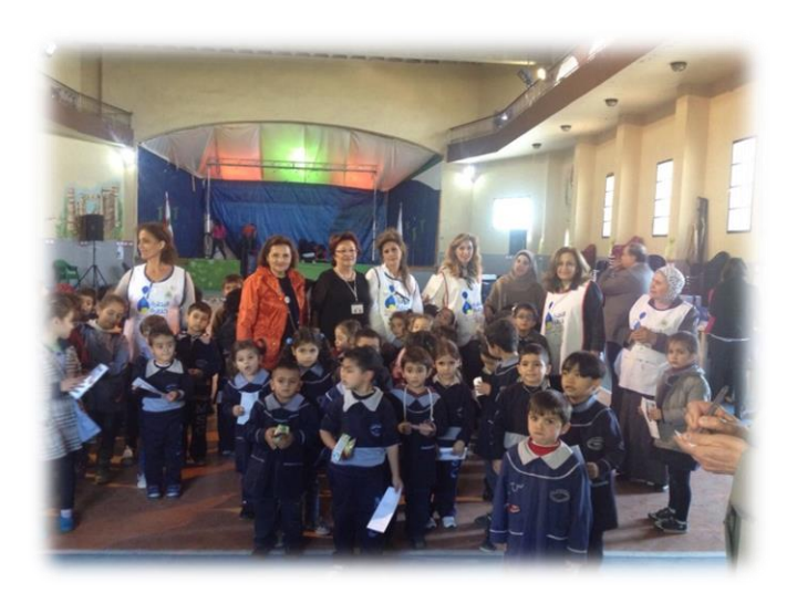
Figure 8: Rotarians in Shhim, Iklim area, on vaccination day.

(coloring books and pens with Rotary logos and bags of snacks and juice).