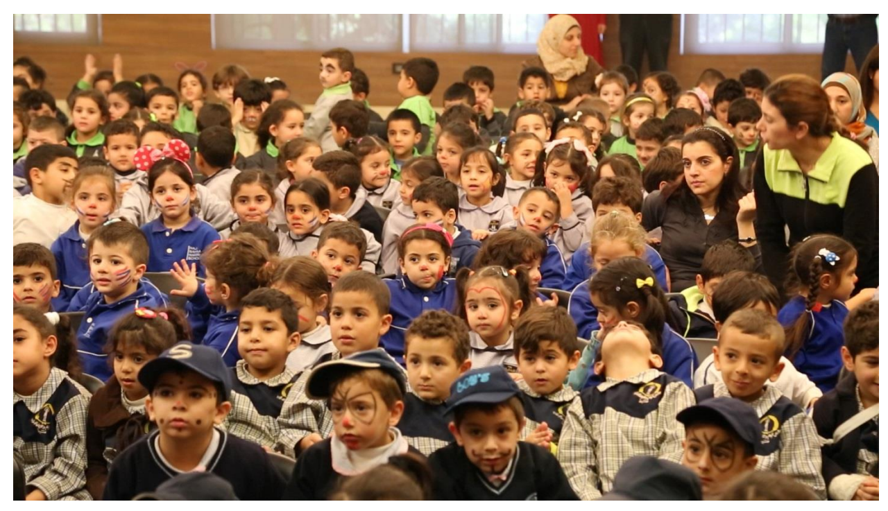
Figure 164: Children on vaccination day in Saida (south Lebanon)