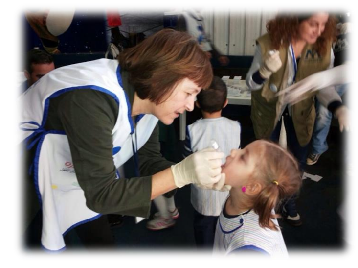
Figure 10: Children in Beirut being vaccinated.

At first, the students were divided into groups of 20, and each group had a facilitator who provided entertainment in the form of songs and games. Afterwards, students were given vaccinations from doctors present. During that time, members of the Rotary and Rotaract family were preparing the goody bags for the students. The bags contained: a stationary set and a combination of juice, sweets and chocolate.