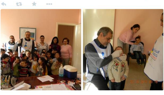
Figure 7: Campaign promotions on Twitter by Dr. Michel Jazzar