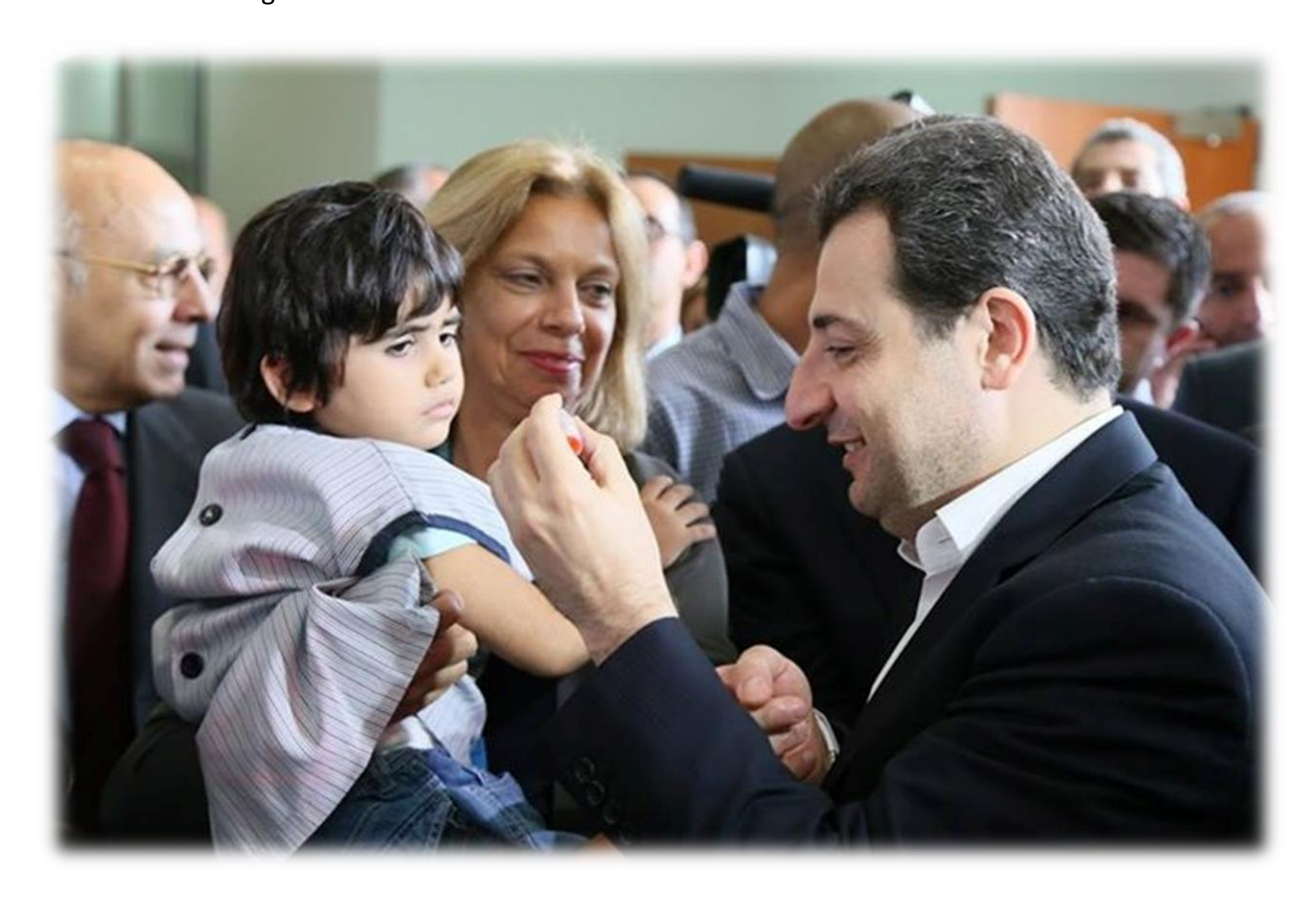
Figure 1: Minister of Public Health of Lebanon, Mr. Wael About Faour, at launch of National Polio Campaign

The campaign intended to target 570,468 children in all governorates of Lebanon, including Syrian children and children from other nationalities living in Lebanon (e.g. Palestinian, Iraqi). The first phase lasted from October 14 to October 21<sup>st</sup>, 2014 and the second lasted from November 15<sup>th</sup> to 21<sup>st</sup>, 2014. Vaccinations were given for free to all children.