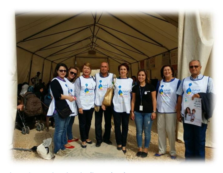
Figure 6: Rotarians in Tripoli, north Lebanon.

Recreational days took place in Tripoli, Mina, Bebnin and Miziara. The political and security situation did not allow our Rotarian fellows to go to Mina and Bebnin, so they participated only in the Tripoli campaign on October 15<sup>th</sup>, 2014. During the recreational day, there was a comedy show for the children (organized by UNICEF), and then the